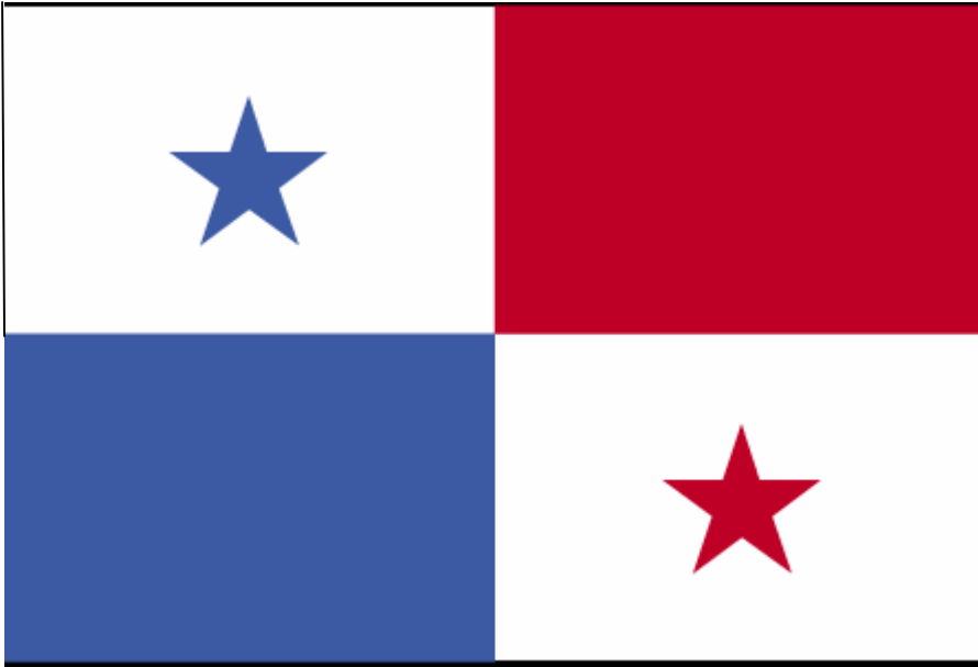
Flag of Panama

This flag was to reflect the political situation of the time. The blue was intended to represent the Conservative Party and the red to represent the Liberal Party. The white was intended to stand for peace and purity; the blue star stands for the purity and honesty of the life of the country; the red star represents the authority and law in the country; and together the stars stand for the new republic.